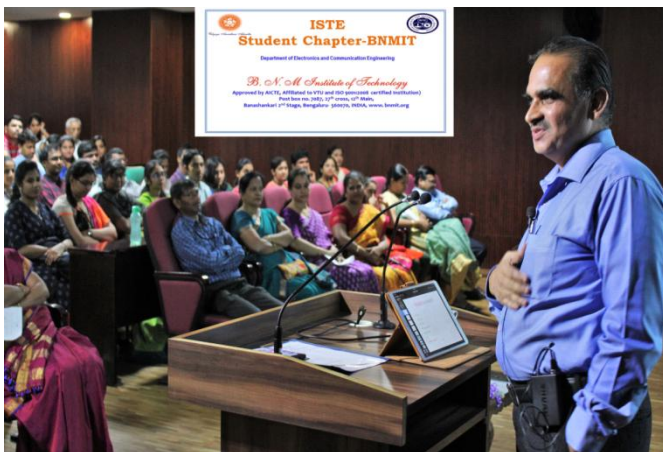
Speaker interaction with the students