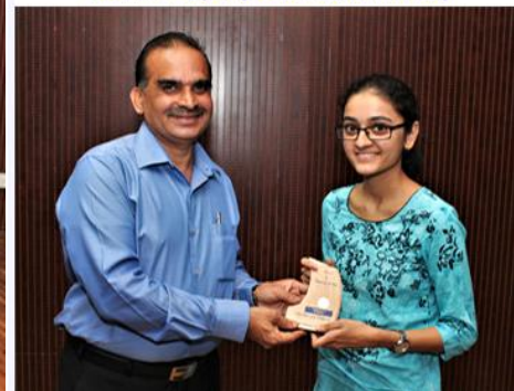
Distribution of mementos by guest