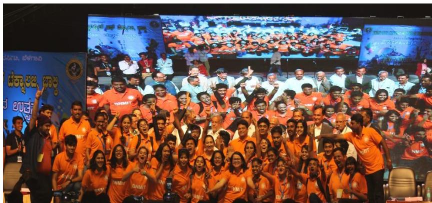
BNMIT won the Overall Championship at VTU Youth Festival -2018

“One word in every page, a message in disguise” Search for it!!