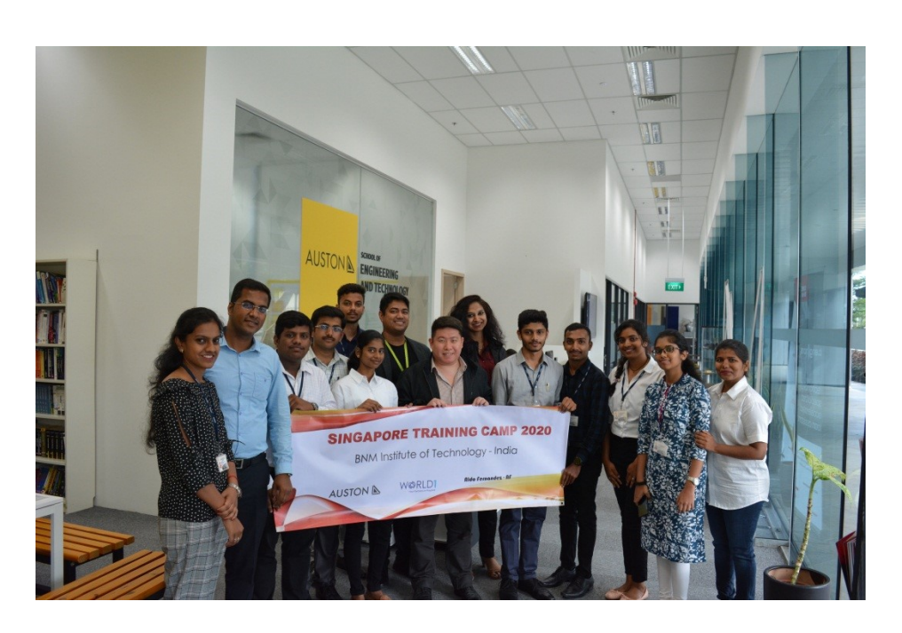
MBA Students with the Staff of Auston Institute of Management During Concluding Session of the Internship Tour