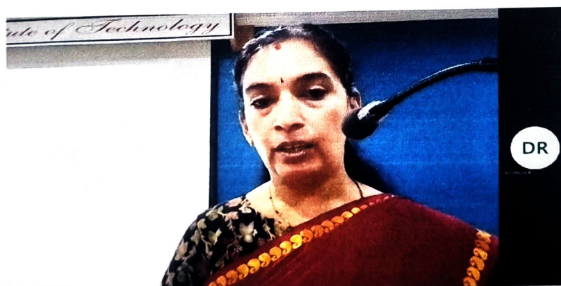
BOS Meeting Discussion with Member (On-Line)