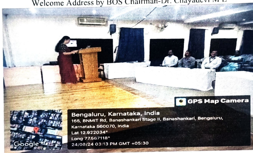
BOS Meeting Discussion with Members