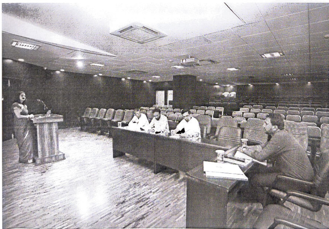
Discussion among the BOS Members