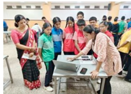
6 th semester Student Demonstrating project to School students