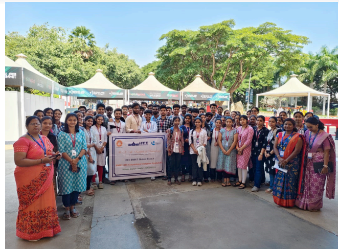
Faculties with 3 rd semester A section students of AIML Faculties with 3 rd semester B section students of AIML