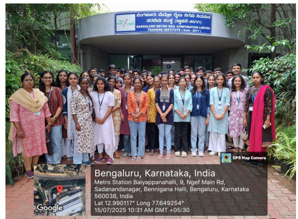
Faculties with 5 th semester A section students of AIML Faculties with 5 th semester B section students of AIML

An Industry visit to BMRCL, Whitefield Metro Depot, Bengaluru , was organized under the banner CSI and IEEE-CIS on 14 th and 15 th July 2025 for students of the 5 th semester 'A' and 'B' section respectively. The visit included a guided walkthrough of a static, non-operational metro train, offering insights into its interiors, control mechanisms, and safety systems. The visit enhanced students' understanding of the engineering and design principles underlying metro operations and effectively bridged theoretical learning with real-world applications in intelligent transportation systems.